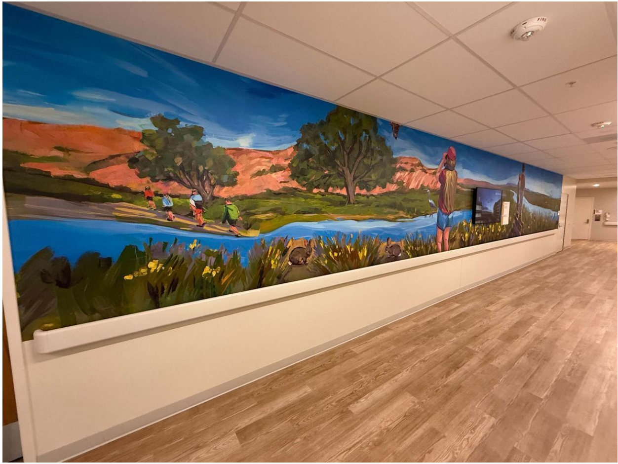
Laura Green UCI Health 6th Floor Murals acrylic 240 x 240 in