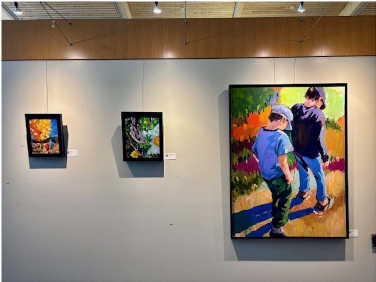
Laura Green Mission Viejo Library Exhibit Acrylic On Canvas 120 x 360 in