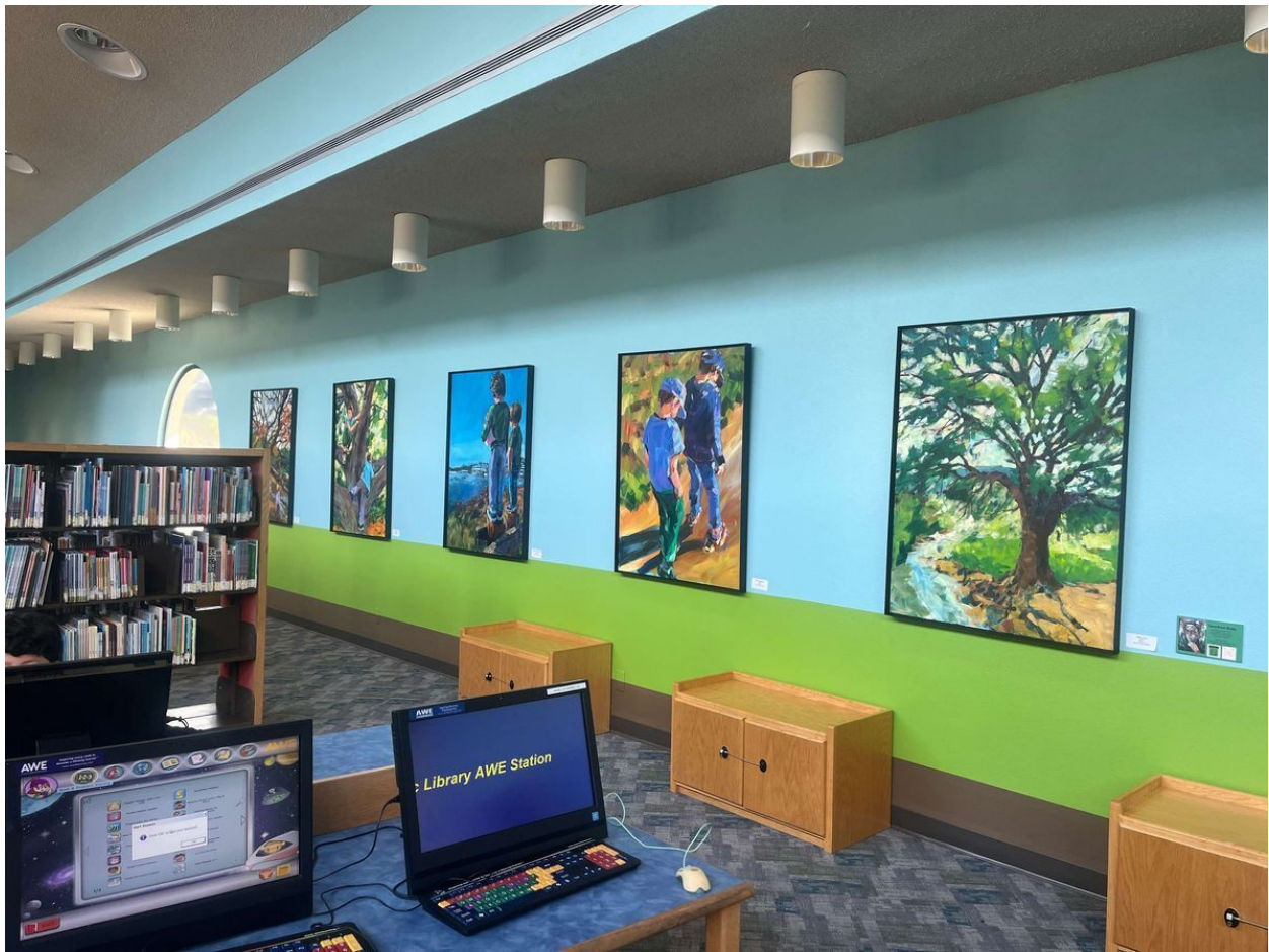
Laura Green Chula Vista Library Children's Area acrylic 120 x 240 in